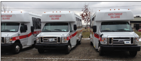
Three new para-transit buses have been added to the North Township fleet. One will replace an obsolete bus while the other two will help meet the increasing need for on-demand transportation in the township.

“If not for Dial-a-Ride, I’d be up a creek without a paddle,” said Januszewski, who hasn’t