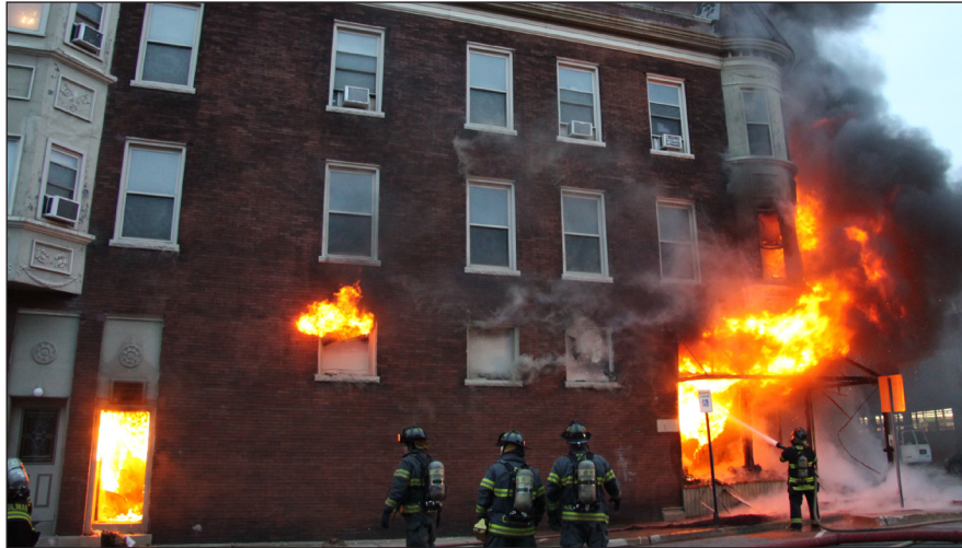
FIRE RELIEF: The North Township Trustee's office provided emergency relief when the beautiful old building on the corner of 119th Street and Sheridan Avenue burned down Jan. 20. Ten families were displaced when their apartments were destroyed in the devastating blaze.