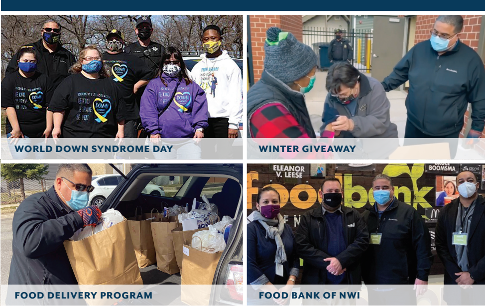
WORLD DOWN SYNDROME DAY

YOUR GUIDE TO NEWS AND SERVICES IN EAST CHICAGO, HAMMOND, HIGHLAND, MUNSTER AND WHITING • SPRING 2021